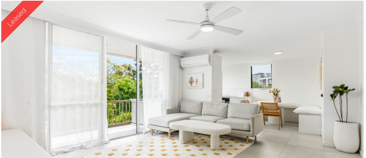
Unit 9, 8 Mawarra St, Palm Beach